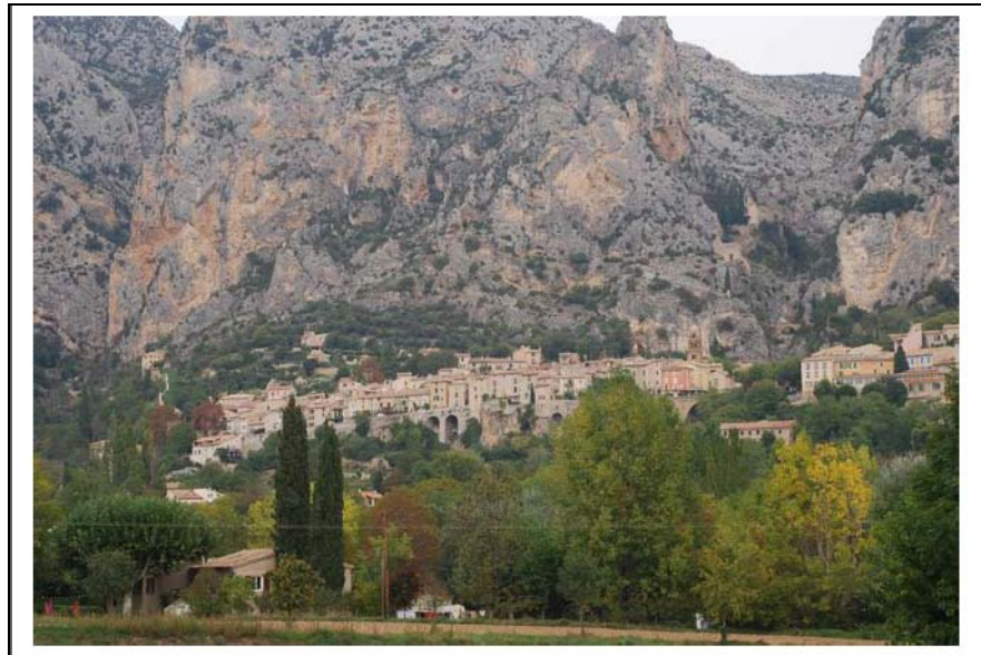
A town in the Alps and tango dancers in Leon