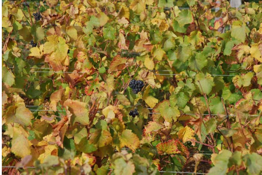
The harvest in Burgundy