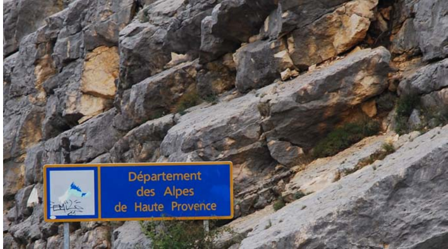
We crossed into the Alps region at the Gorges du Verdon.