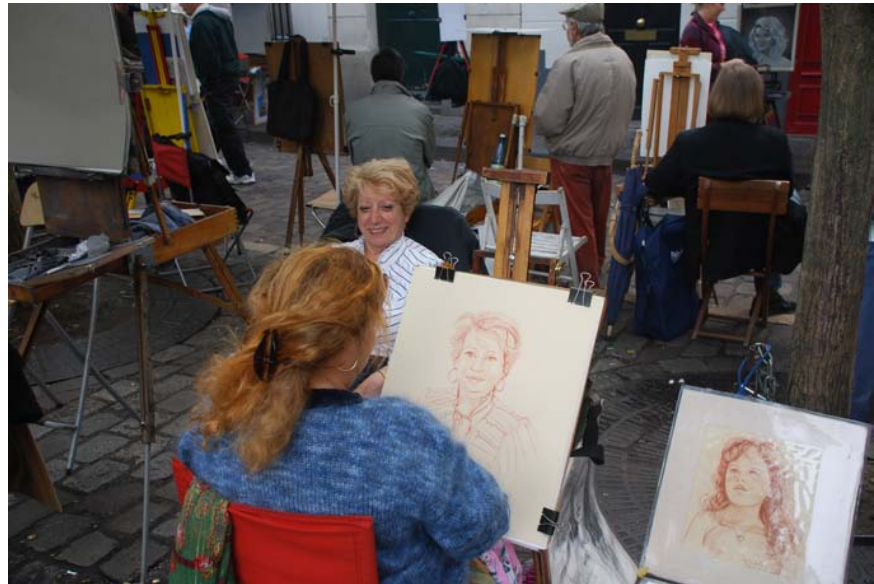
Art! Art! Art! nothing but Art.