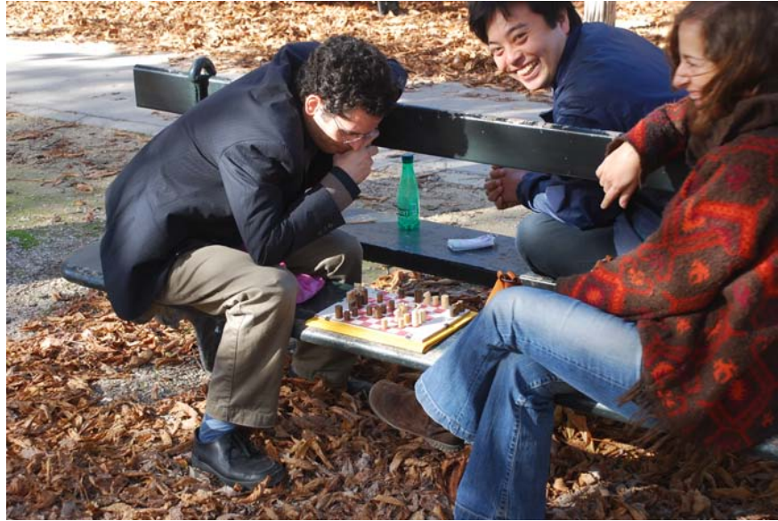
Checkmate on a Sunday afternoon in the Garden!