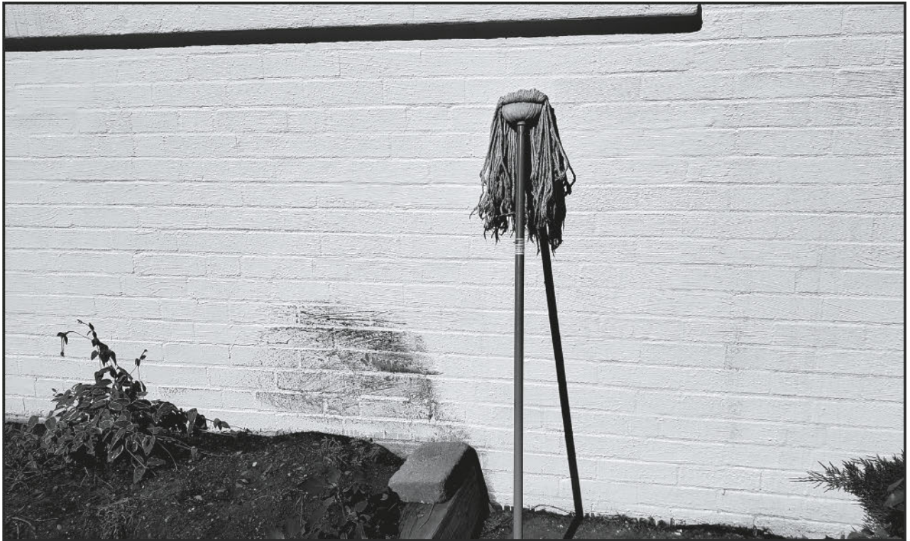
Missed a Spot