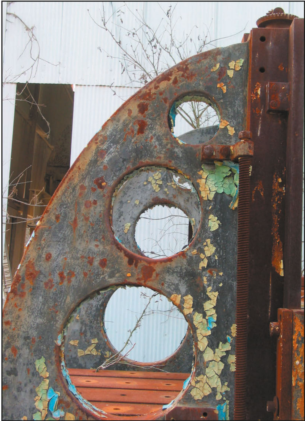
Abandoned Industry 07