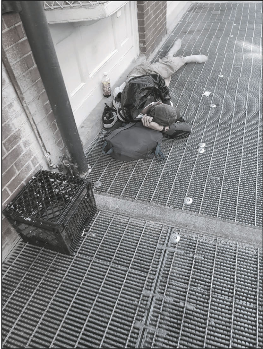
Homeless in the French Quarter