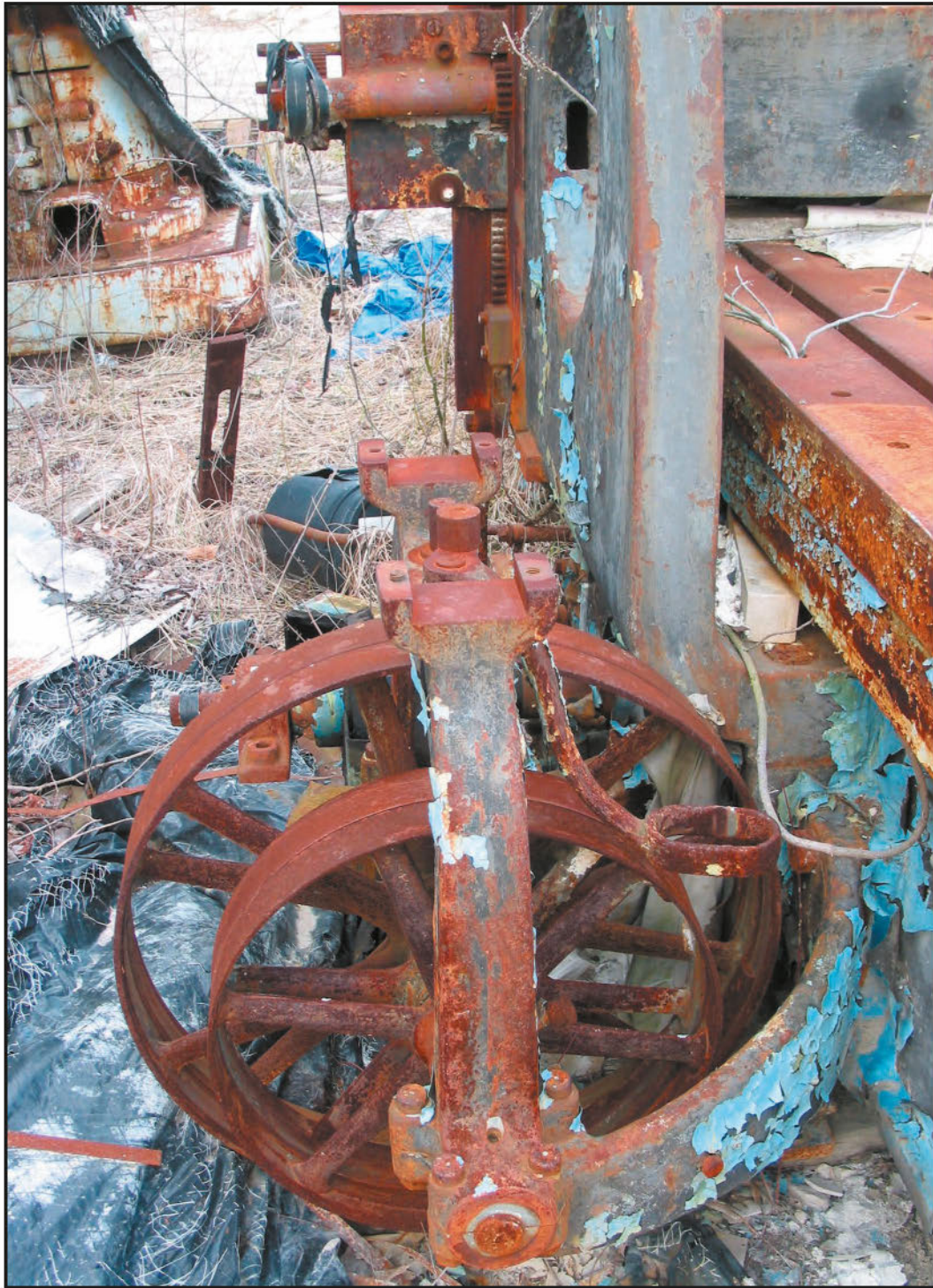
Abandoned Industry 12