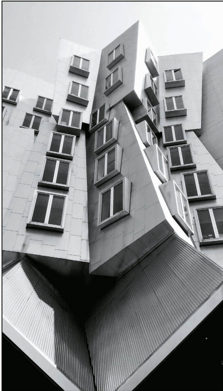
MIT Stata Center