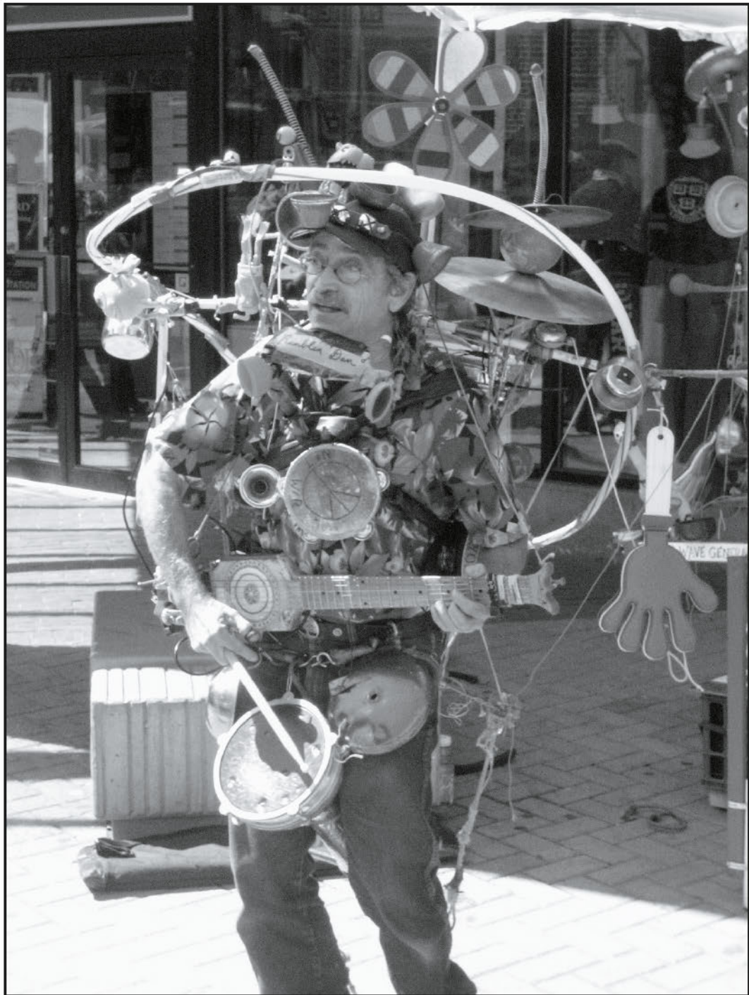
One Man Band