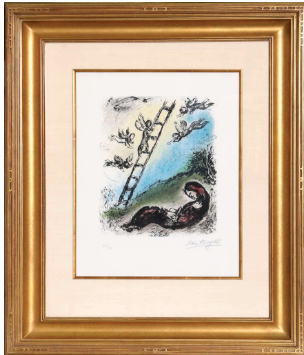
Artist Marc Chagall (1887-1985), "Jacob and the Angels", Lithograph, 36.5" x 30", 1980, Long Island City. 15