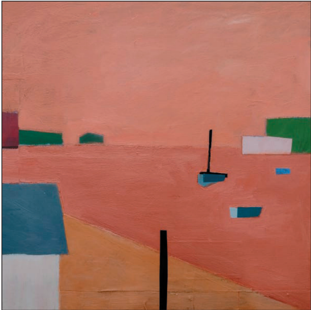
Calm Harbor – Pink Evening, Acrylic and collage on panel, 24 x 24