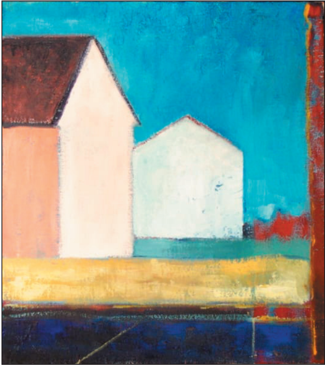
Solitude, Oil on linen, 18 x 16