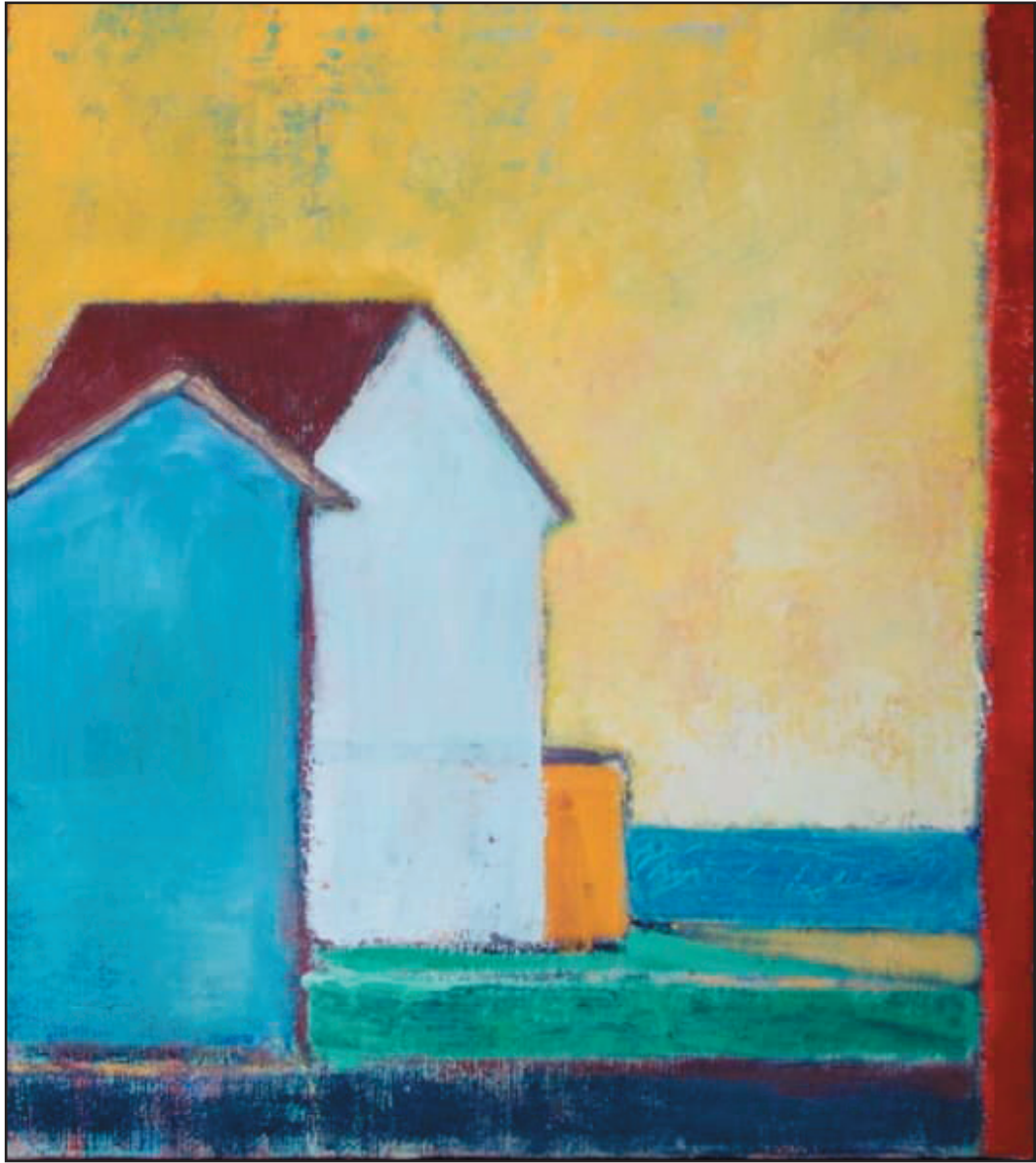
Hope, Oil on linen, 20 x 16