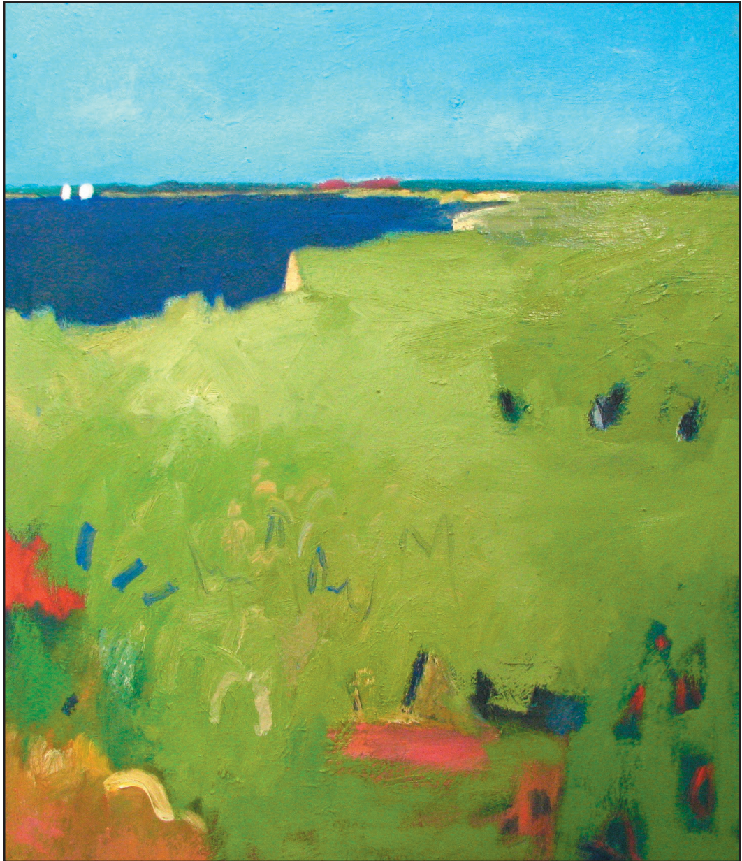
Wetland, Oil on canvas, 36 x 30