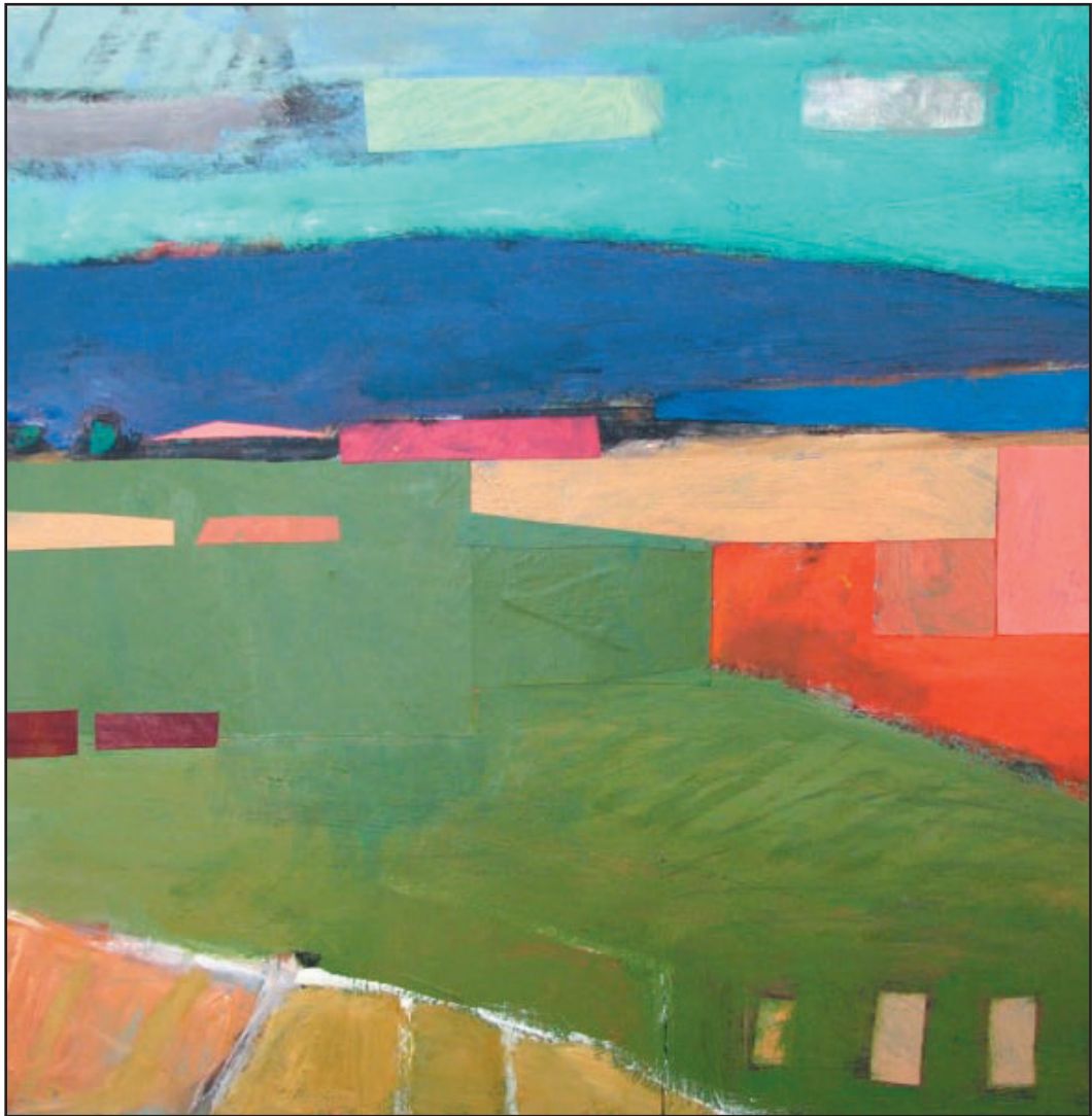
The High Road, Acrylic and collage on panel, 16 x 16