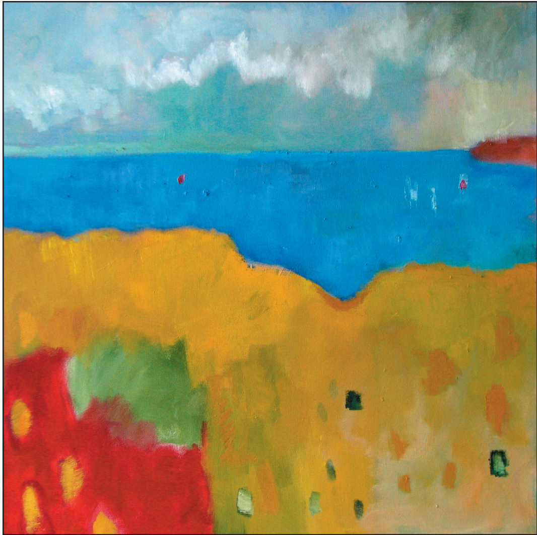
Off the Banks – For Marsden Hartley, 30 x 30