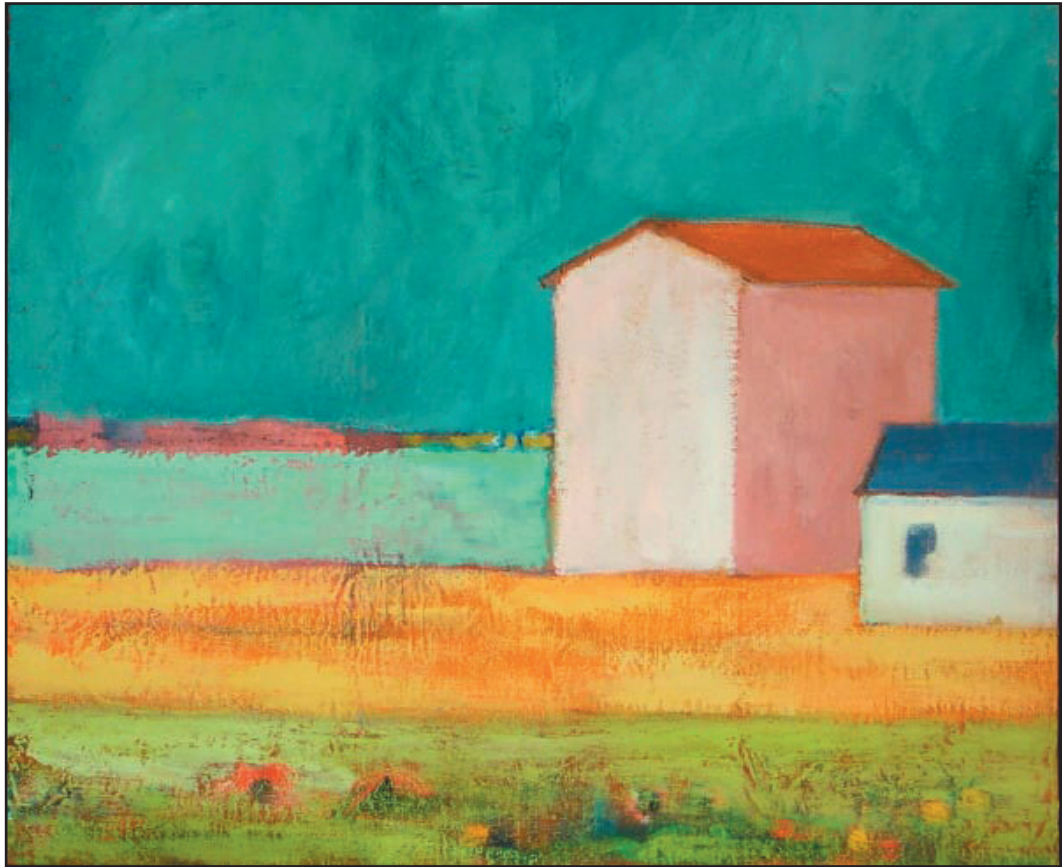
Equilibrium, Oil in linen, 20 x 24