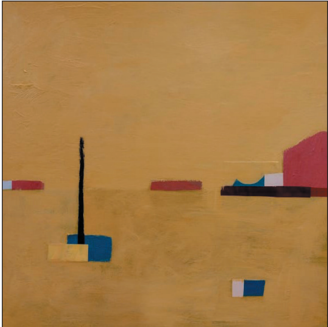
Calm Harbor – Yellow Morning, Acrylic and collage on panel, 24 x 24