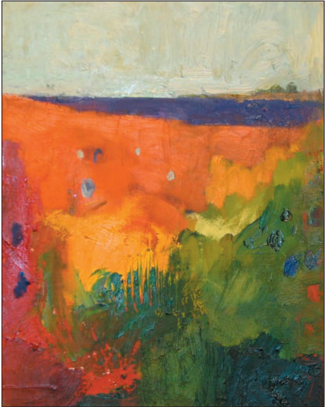
Beachcombers, Oil on panel, 14 x 11