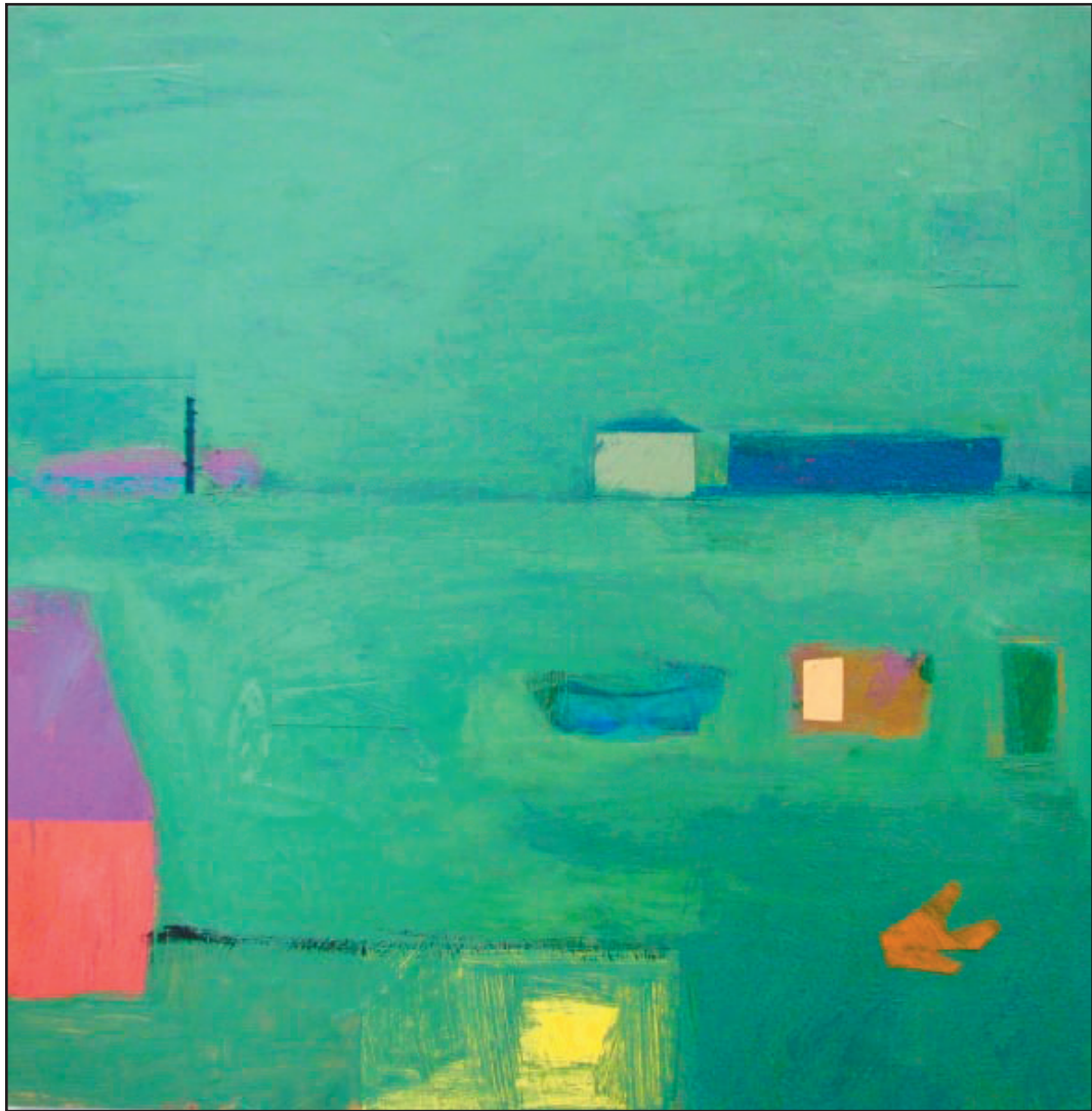
Green Mist, Acrylic and collage on panel, 16 x 16