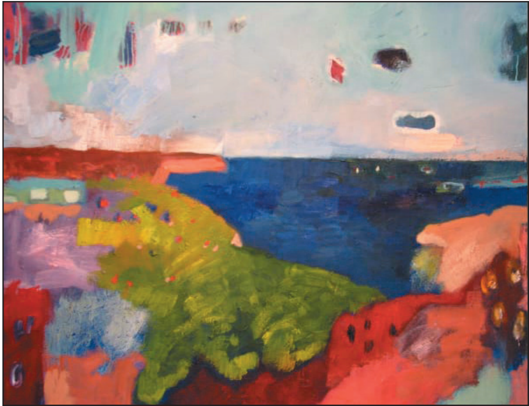
Entropy, No. 2, Oil on canvas, 24 x 30